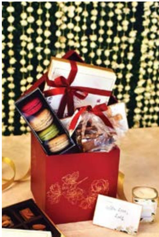
Gift given to the women who won