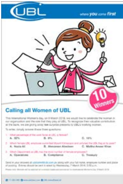
Women's Day Initial E-mailer and Quiz Questions