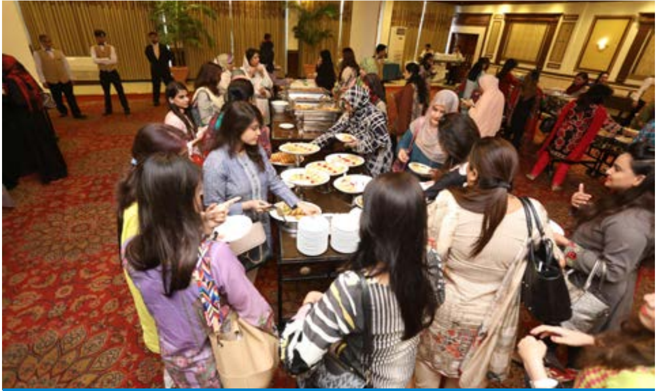
Attendees enjoying hi-tea