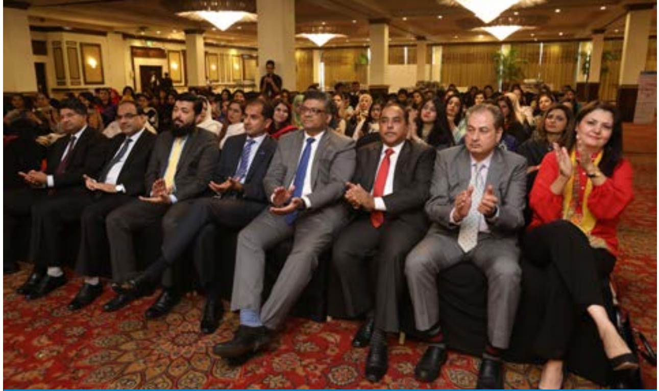
Senior Executives of the bank listening to the session