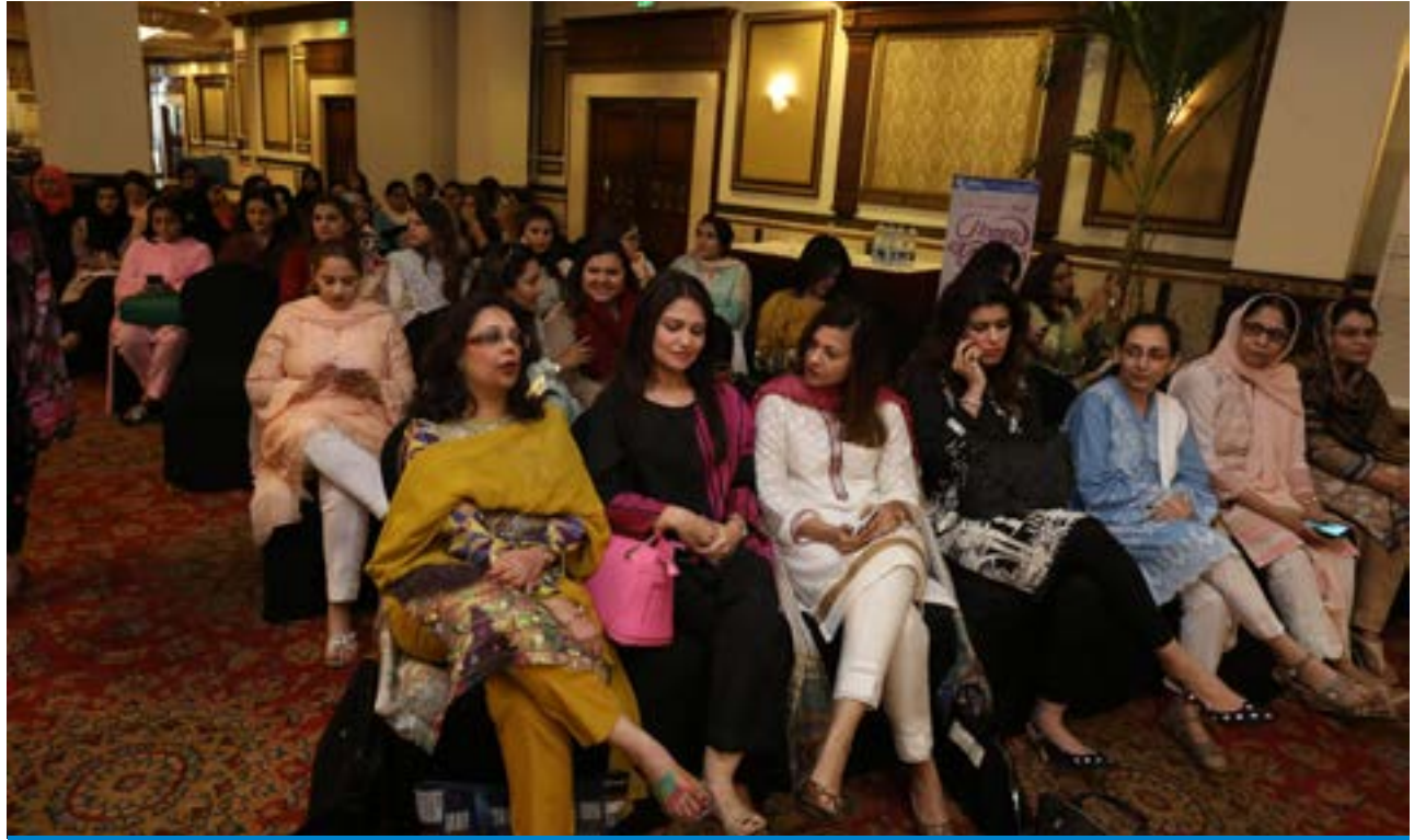
Audience at the event