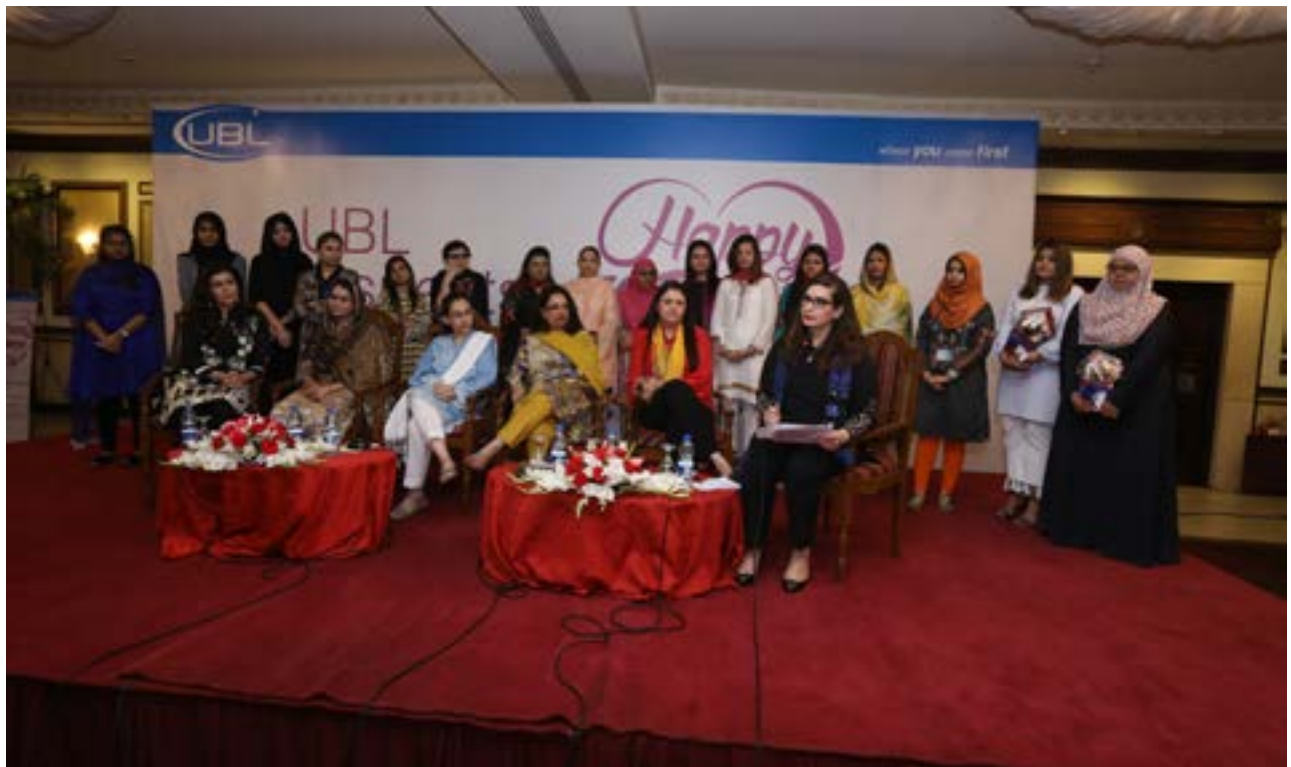
Lucky Draw winners and their mentor through the 'Empowered Women Empower Women' program