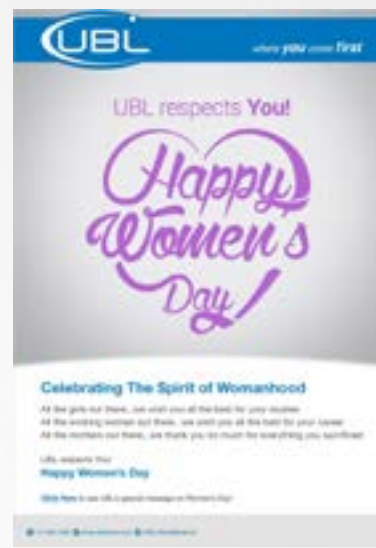
Women's Day E-mailer