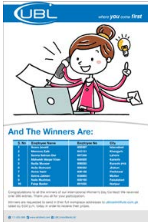
Winners Announcement on Women's Day