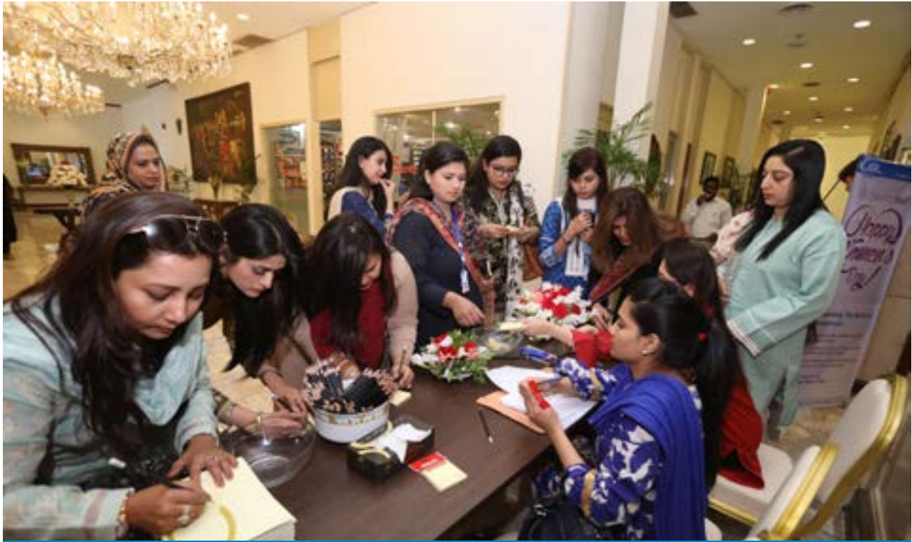
Registration desk at the event