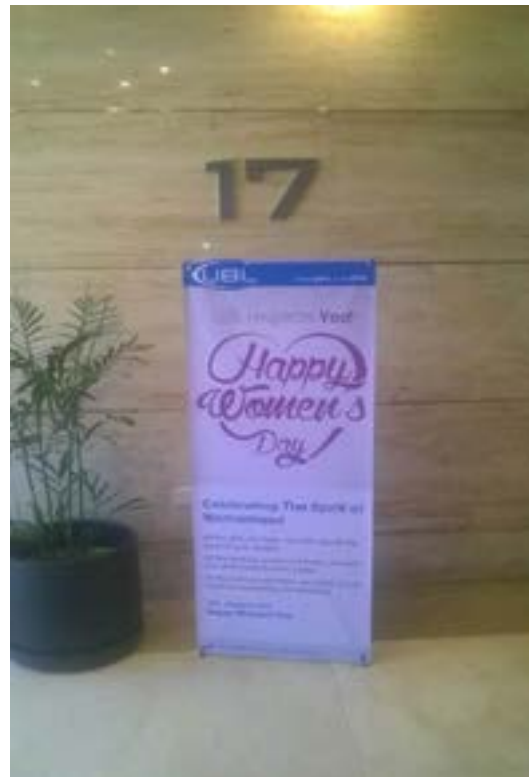
Women's Day Standees