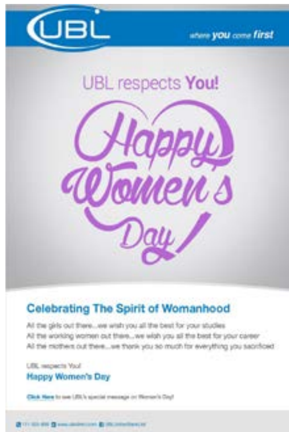
Women's Day E-mailer

Not just that, UBL also ran an International Women's Day congratulatory campaign on its social media platforms. The theme of this campaign was 'UBL respects You'. The animation that was part of the campaign can be viewed here. The video was viewed over 241, 648 times on Facebook and more than 10,000 times on Twitter. More than 1 Million people were reached through the campaign on Facebook alone.