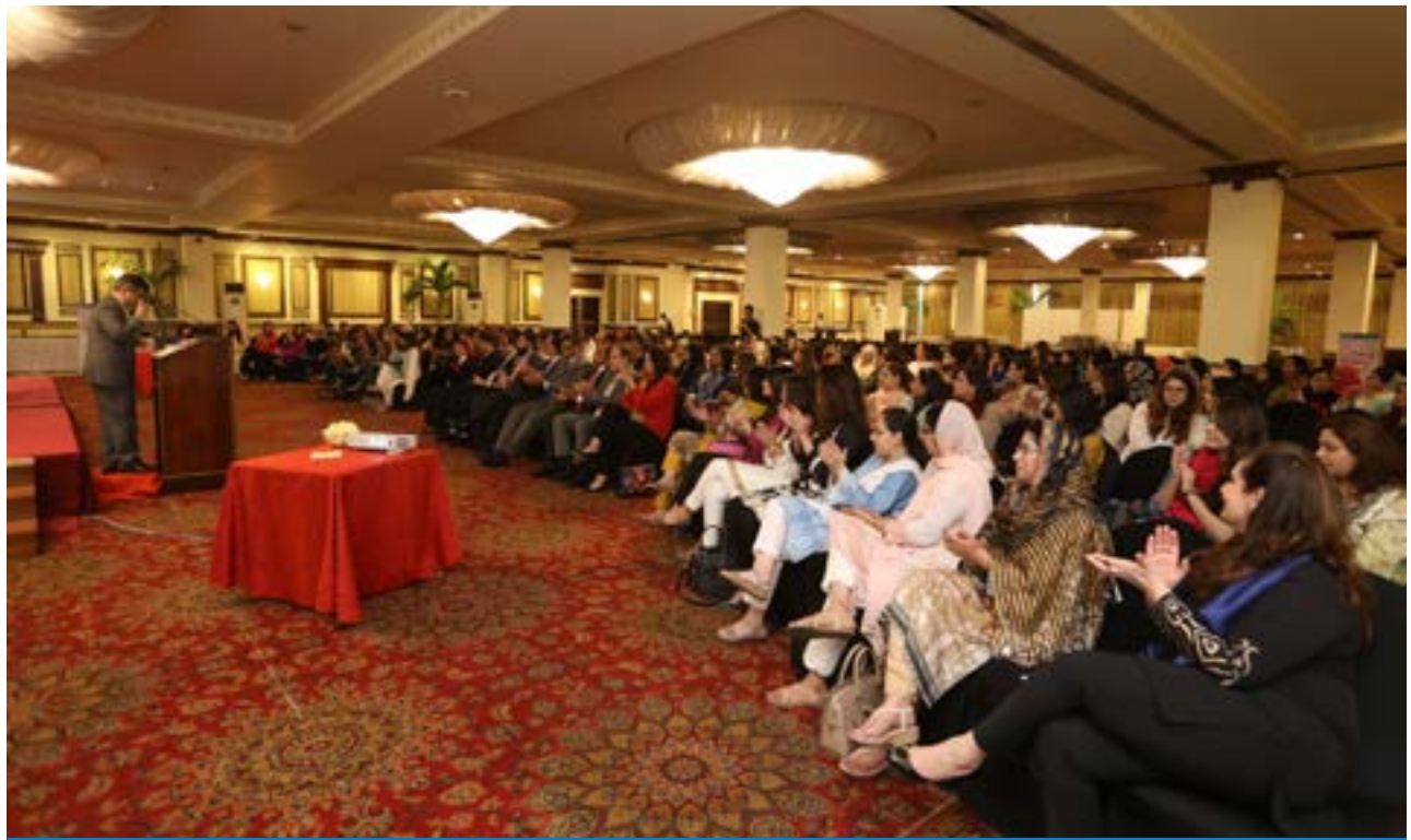
Audience at the event